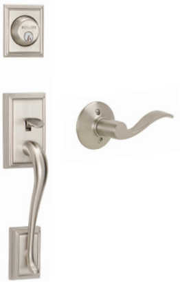
ADDISON ENTRANCE SET WITH ACCENT LEVER