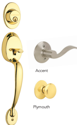
PLYMOUTH ENTRANCE SET WITH ACCENT LEVER WITH PLYMOUTH KNOB