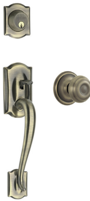
CAMELOT ENTRANCE SET WITH GEORGIAN KNOB