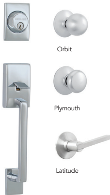
CENTURY ENTRANCE SET WITH ORBIT OR PLYMOUTH KNOBS, OR LATITUDE LEVER